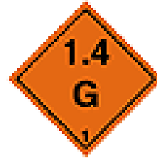
1.4G Explosives placard