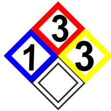
NFPA 704 placard